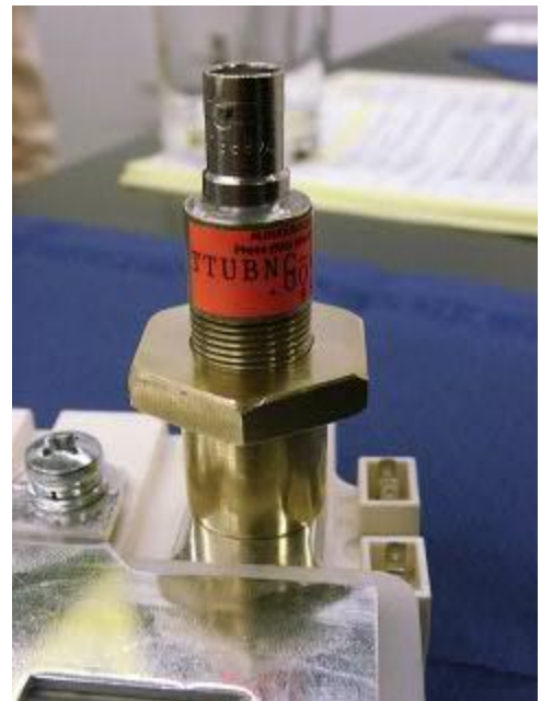
Picture 3: SBNC shunt replaces screw between busbar and module (ultra low parasitics)