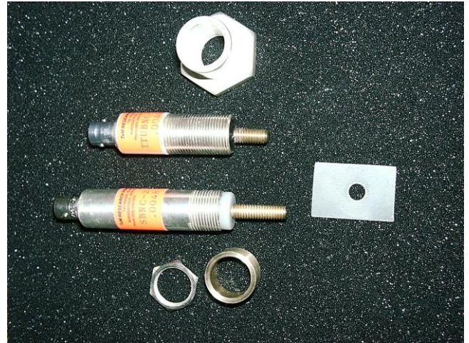
Picture 2: SBNC shunt optional with tiny locking nut for better access near snubbers